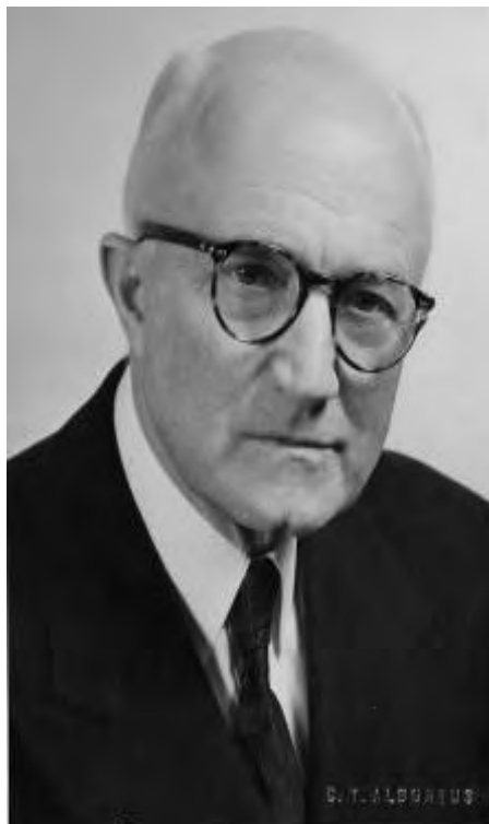
Kenneth Scott Latourette